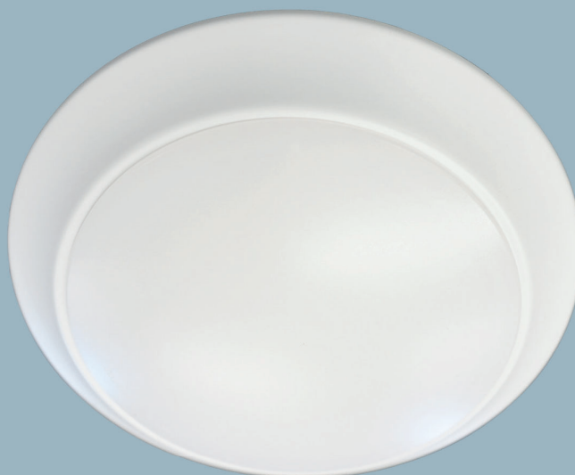
AL-SMD7.4** RANGE 3000K/4000K